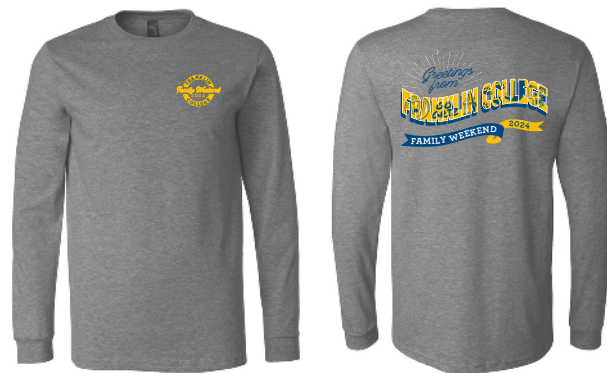
FAMILY WEEKEND T-SHIRT $15

4. GET READY TO HAVE A BLAST AT FAMILY WEEKEND!