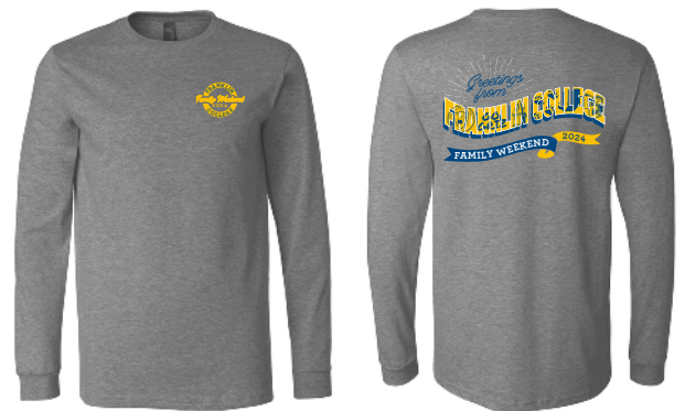
FAMILY WEEKEND T-SHIRT $15

4. GET READY TO HAVE A BLAST AT FAMILY WEEKEND!